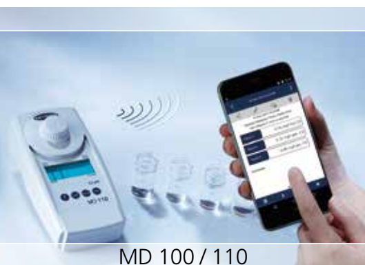
MD 100 / 110