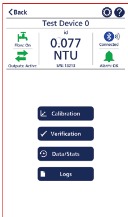
Screen views of AquaLXP™ - Interface.

The connection of the device control via the app can alternatively be carried out via existing USB port. Output for 0 / 4-20 mA as standard and additional optional interfaces for data transmission via Modbus or Profibus for the process-based transmission of measured data are provided. In addition, AquaLXP™ software has extensive and complementary logging, data transfer, trend graphics and mathematical evaluation functionality.