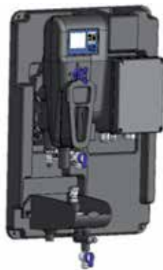
Lovibond® PTV 1000/2000 Process-Turbidimeter.

as design- and constructive considerations to realize low flow rates ( from 30 ml/min ) and low maintenance requirements have been the main focus of this instrument development. Moreover, a patented bubble-free method for calibration and verification using ready prepared and stabilized formazine with no user risk to come in contact with the standard solution has been developed.