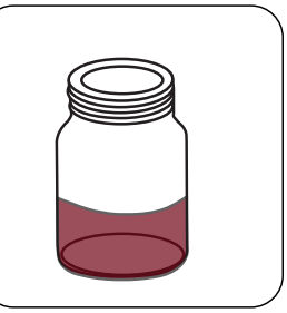
The sample will turn wine red .