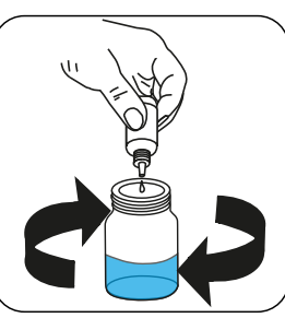
Add Hardness LR Titrant TH3 or Hardness HR Titrant TH4 drop by drop to the sample until colouration turns from wine red to blue.

Note: Make sure to swirl the jar after adding each drop!