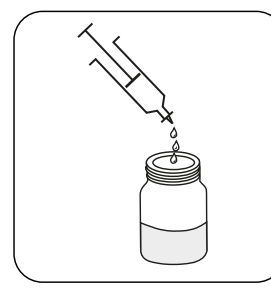
Attention!Select the appropriate sample volume according to the instructions in the chapter Sampling.