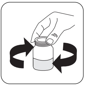
Swirl to mix.