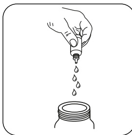
Attention! Record the added.

Note: Make sure to swirl the jar after adding each drop!