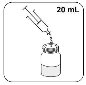
Fill the jar with 20 mL of the cooled sample.