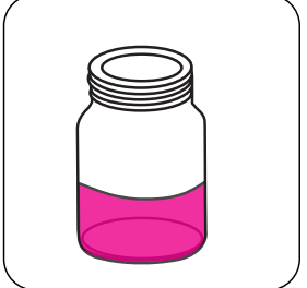
The color should persist for at least 10 seconds.

Calculate test result: Tannin (as Tannin) mg/L = Number of drops x 10