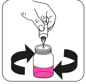
Add Tannin Titrant TN2 until colouration turns from colourless to pink.

Note: Make sure to swirl the jar after adding each drop!