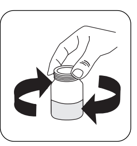
Swirl to mix.