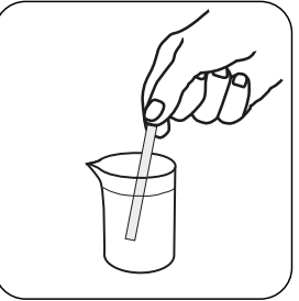
Remove one test strip. Hold Dip the test strip into the solution to be tested without agitation.