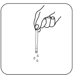
Shake off excess liquid.