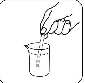
Remove one test strip. Hold Dip the test strip into the solution to be tested so that all pads are completely immersed.