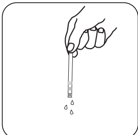
Shake off excess liquid.