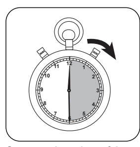
Compare the colour of the test strip within 30 seconds with the colour chart provided.